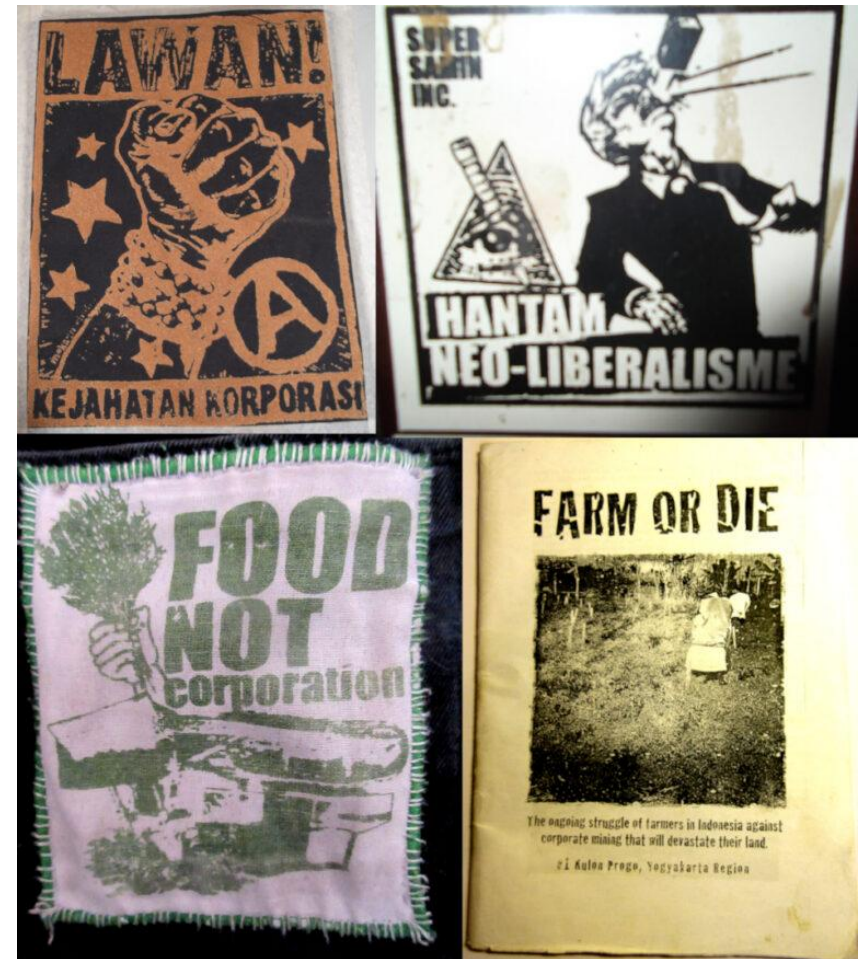
Examples of posters, stickers, patches and zines opposing neoliberalism and extractivism in Indonesia.

During the political upheavals against the New Order regime in the late 1990s, many anarchist sympathisers claimed membership of Anti-Fascist Front (Front Anti-Fasis, FAF), which was founded in 1997 in Bandung, bringing together punks, street kids [anak jalanan] and petty thugs [preman]. Some FAF members joined the socialist People's Democratic Party (or PRD) in 1999 (F Putra 2022), but this was a disappointing experience for the anarchist-minded activists, and the opinion of those who had kept their distance from the PRD was vindicated – they had argued all along that entry into party politics led to co-optation and the stifling of critical speech (anonymous interviewee 2022).