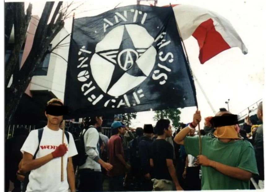
Front Anti Fasis circa 1998.

Within and beyond these evolving groups and networks, anarchists have been engaged in a wide range of activisms, including: running infoshops; publishing books, pamphlets and zines; engaging in solidarity actions with local communities; boycott and sabotage actions; demonstrations and black bloc actions; and artistic performance interventions. Important fractions of the movement are involved in community support for urban laborers, rural peasant communities, or populations suffering land grabs and ecological degradation. The proliferation of itinerant libraries (or perpustakaan jalanan), which developed from 2009 in Bandung and have spread elsewhere, highlights the focus on education. These libraries also provide free food, via public kitchens (or dapur umum) organised under the Food Not Bombs banner (Damier and Limanov 2017). The Anarkis.org website, founded in 2014, also serves as a vital resource for self-education and critical discussion within the movement.