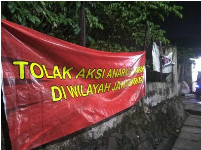
From Inti Jaya News. It reads: 'Reject anarchist [and Marxist?] actions in the West Java region'.