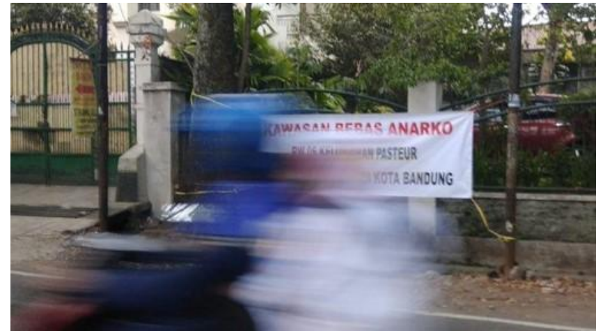
Top line reads: ‘Anarcho-free area’.

With echoes of the contemporary situation in Indonesia, the colonial government used the anarchist label to arrest those who criticized the government. For example, in 1927, the Dutch authorities arrested several members of Sarekat Ra’jat (formerly known as Sarekat Islam Merah, or Red Islamic Association), who were found guilty of the charge of anarchism, and subsequently banished to West Papua (Suryomenggolo 2020).