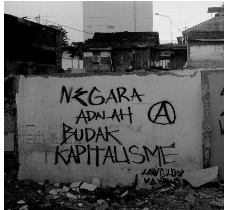
Graffiti on the ruins of a demolished house in Tamansari, Bandung, c. 2019. It reads: 'The state is a slave to capitalism'.